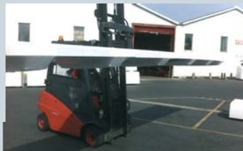
Cladding & roof panels