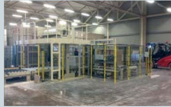
Automatic spiral wrapping machine in production line for Gypsum wallboard