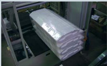
EPS blocks for floor insulation