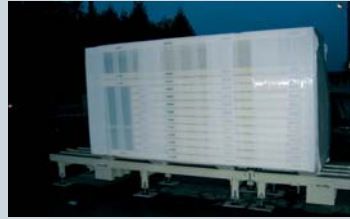
Sandwich panels with EPS runners