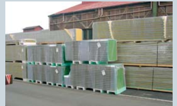
Stretch film packaging with automatic wood/EPS runners feeder. No steel strap required.