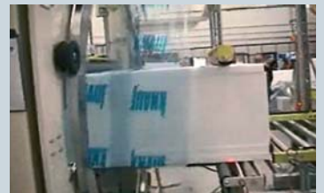
EPS insulation panels