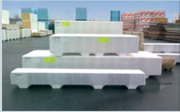
Sandwich panels with EPS runners